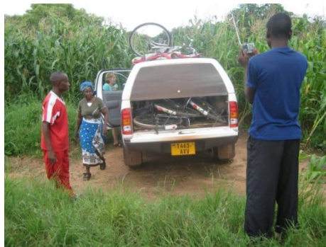
Unloading in Mwakashindye