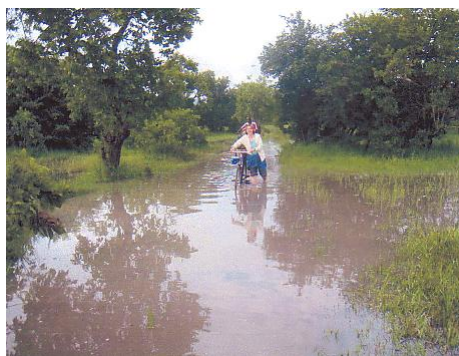
The last 6 km by bicycle after rain